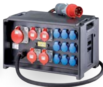
EverBOX – mobile distributors