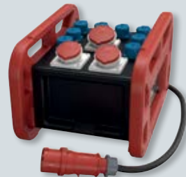
EverBOX GRIP – mobile distributors