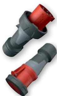
PowerTOP® Xtra Plugs/Connectors