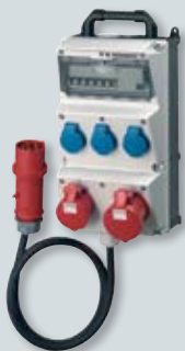
1 AMAXX® trade-fair stand combination