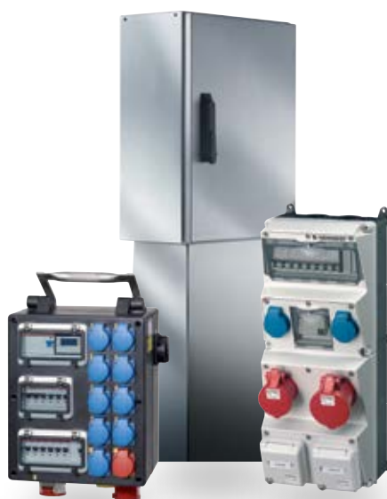
EverGUM® trade fair distributors