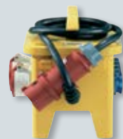
4 Mobile EverGUM® distributors