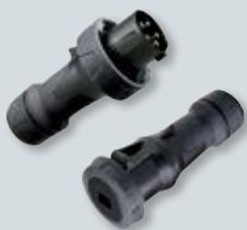
CEE-plugs and connectors