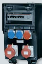
MENNEKES EverGUM® receptacle combination