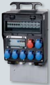
EverGUM® trade-fair stand distributor

In this regard, functionally and spatially they adapt perfectly to the specific requirements: Through suspension/hang-up and set-up they integrate effectively in every trade fair stand, and they can be individually fitted with CEE plugs and sockets SCHUKO®, RCD and CB switches, switch-On/switch-Off elements, load-break switches, energy meters or energy measurement systems.