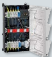
AMAXX® receptacle combinations