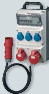
AMAXX® trade-fair stand combination