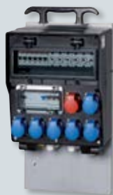
2 EverGUM® trade-fair stand distributor