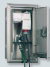
Flush-mounted combinations for power and water connection