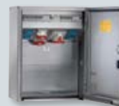
Lockable power posts